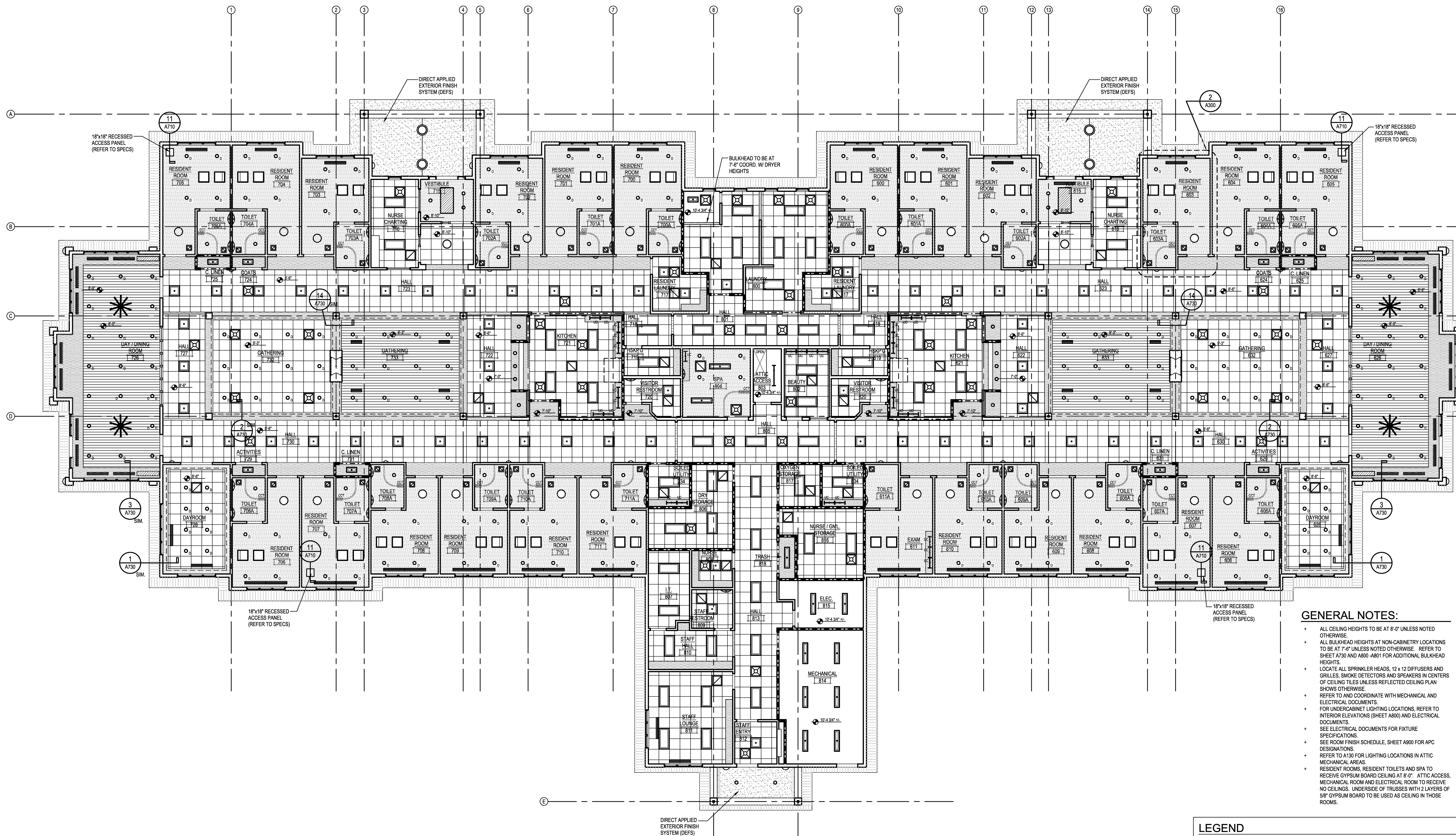
1 REFLECTED CEILING PLAN SCALE: 1/8"=1'-0"